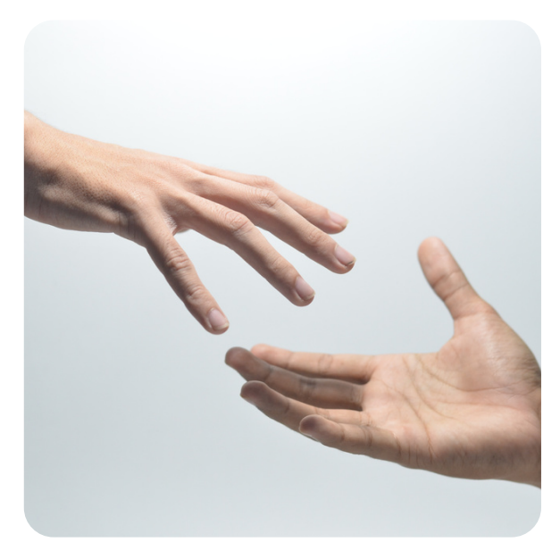
Hear From Our Clients